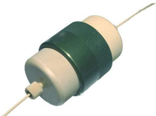
Prep Scale (20mm)

See pages 66 - 67 for information about the Prep and Semi-Prep Cartridge Holders