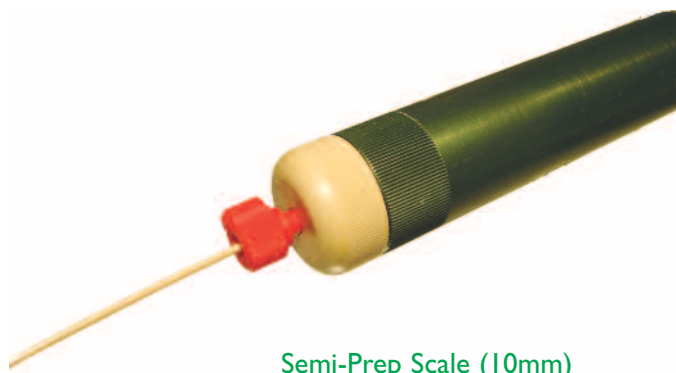
Semi-Prep Scale (10mm)